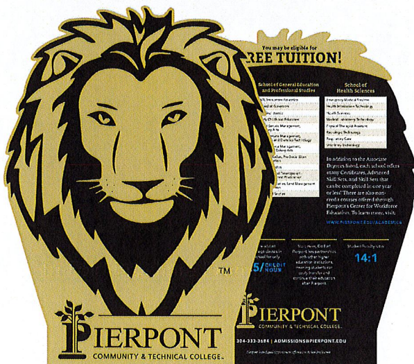
Program Sheet - Recruitment Fairs